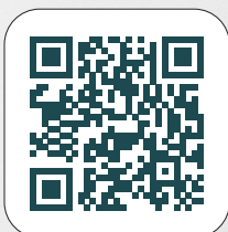
Sharm Derma 2025 PR & Media Kit

Headquarters: 16 Fathi Talaat Street, Sheraton Buildings, Cairo Phone: +20 (2) 22666152 / +20 100 163 4534 Email: khalid@misr2000online.net Web: www.misr2000.com